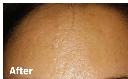
Female Procedures: 6