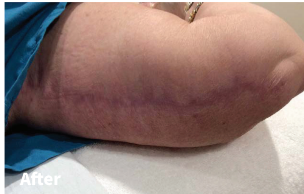
Brachioplasty scar 8 weeks after third microneedling treatment.