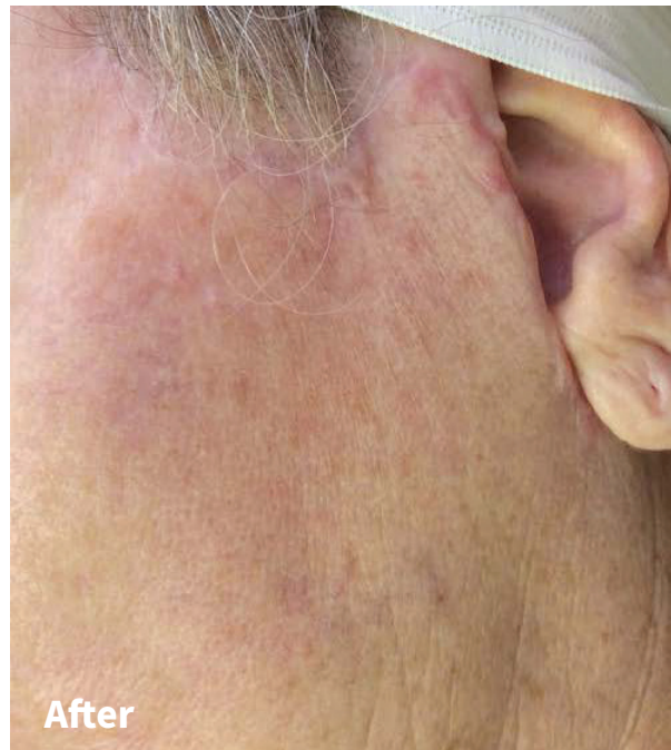
Face lift incision scar 8 weeks after third and final microneedling treatment.