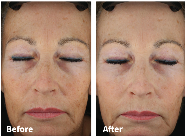
Female Procedures: 4