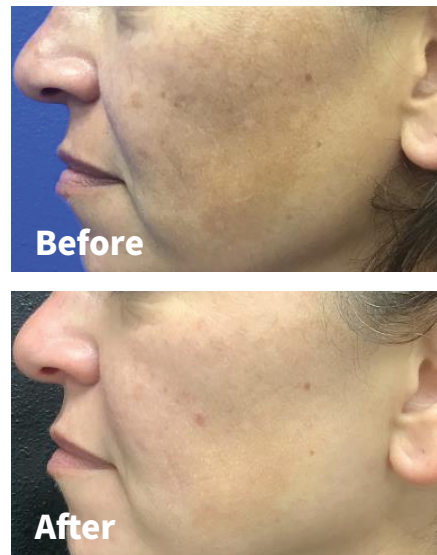
Female Procedures: 2