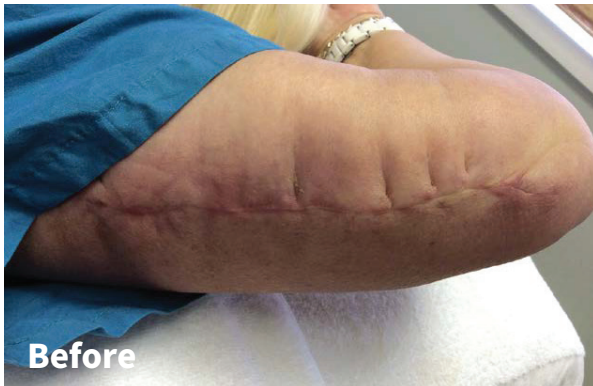
Brachioplasty scar 6 weeks postoperatively before first microneedling treatment.