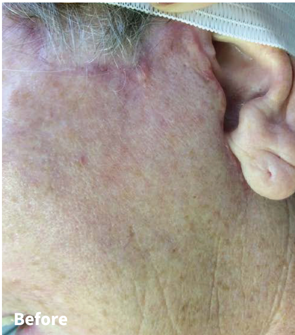
Face lift incision scar 13 weeks postoperatively before first microneedling treatment.

Photos courtesy of: Claytor, R. Brannon M.D.; Sheck, Casey Gene D.O.; Chopra, Vinod M.D.. Microneedling Outcomes in Early Postsurgical Scars. Plastic and Reconstructive Surgery; September 2022 - Volume 150 - Issue 3 - p 557e-561e doi: 10.1097/PRS.00000000000009466