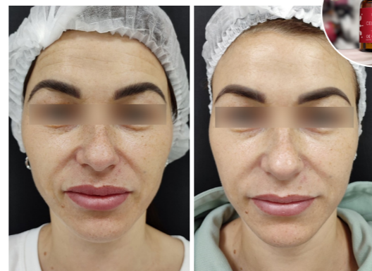
Results after 4 sessions with 2-3 weeks intervals with Cellbooster® LIFT.