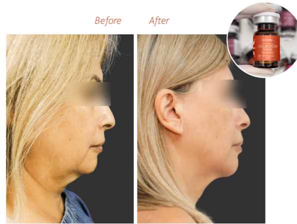
Results 21 days after the 1st treatment with Cellbooster® SHAPE (2 x 3ml injected).