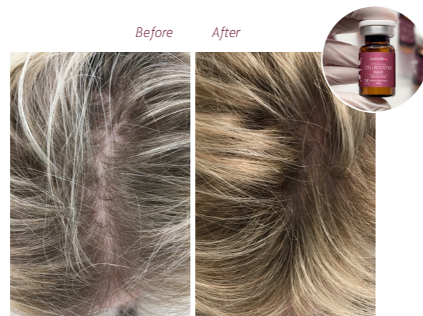
Results after 3 sessions with 2-3 weeks intervals with Cellbooster® HAIR.