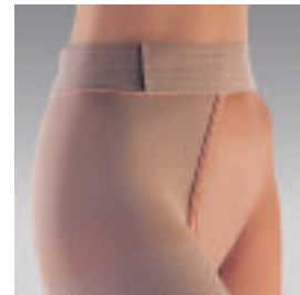
Thigh stocking with waist attachment (left-side or right-side fitting)

All models are available in the straightforward, proven SIGVARIS size range, in three compression classes. In short and long open-toed versions. A custom-made closed-toe version is also available.